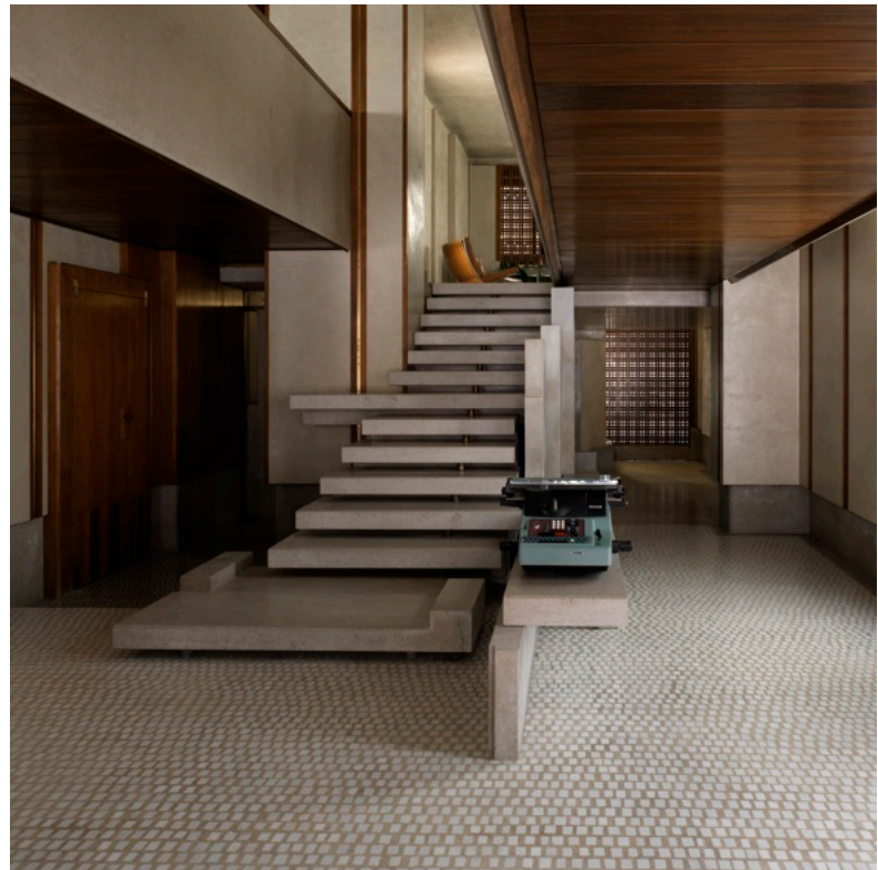
Figure 3: Olivetti Store floor in Piazza San Marco, Venice

* All measurements are approximate; the cutting is hand-made, like the original floor designed by Carlo Scarpa.