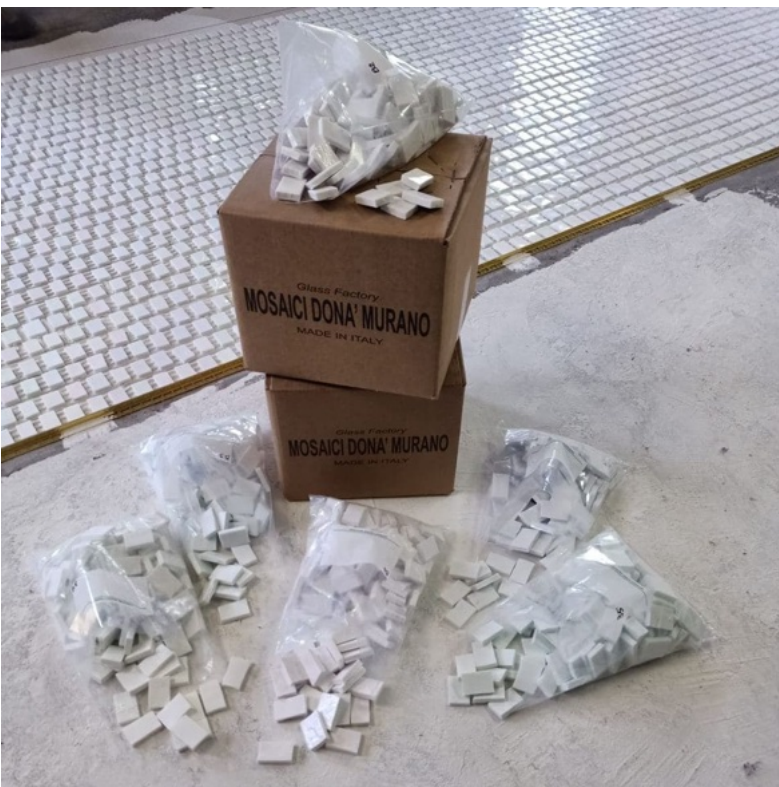
Figure 2: Carlo Scarpa mosaic pieces, white color, standard format

Website: https://www.mosaicidonamurano.com