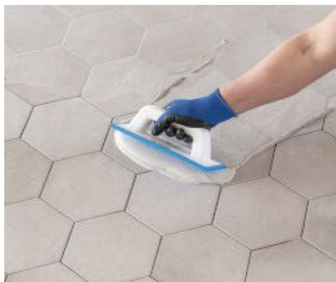
Application of Keracolor FF with MAPEI float

Any residual powdery haze can be cleaned from the surface with a clean dry cloth. After the final cleaning, if the surface of the floors or walls are still contaminated with cementitious residues, an acid cleaner can be used (e.g. UltraCare Keranet ), when the grout is completely cured. If a product to remove grout residues at the time of application is required, the use of UltraCare Keranet Easy , suitable to remove excess grout from surfaces immediately after application, is recommended. For the use of products from the UltraCare range, please refer to the relative Technical Data Sheets.