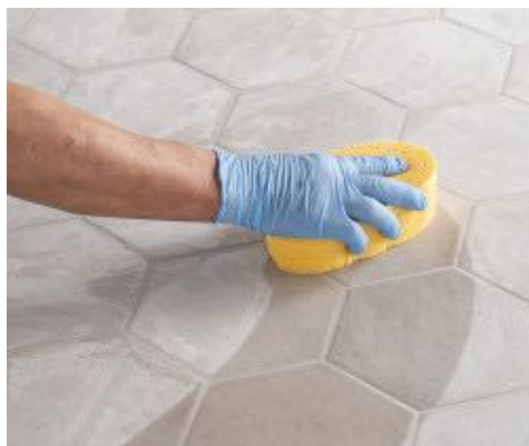
Cleaning and finishing joints with a hard cellulose sponge